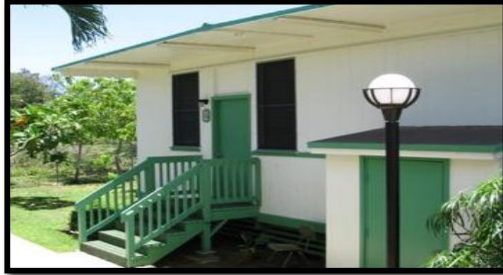
Weinberg Village Waimanalo

A clean and sober service-enriched transitional housing program for homeless families with minor-aged children.