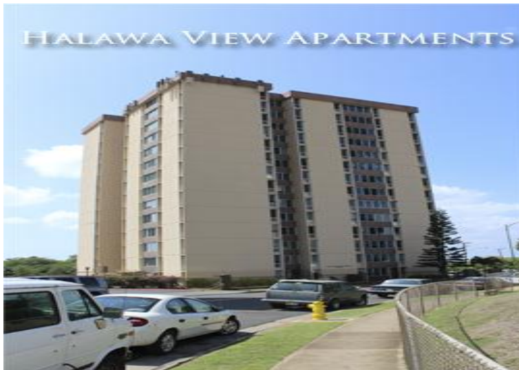
Halawa View Apartments

This is a low-income apartment. The government gives funds directly to this apartment owner. They charge lower rent for low-income persons.