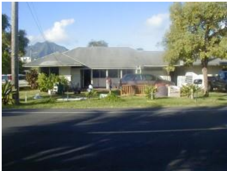
Our Windward Family Center is a great location right in the heart of Kailua.