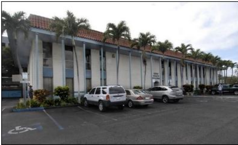
Our Family Center in Honolulu is located in the Harry and Jeanette Weinberg Kukui Center

Our mission is to mobilize existing community resources to aid families with children experiencing homelessness and help them transition to sustainable independence.